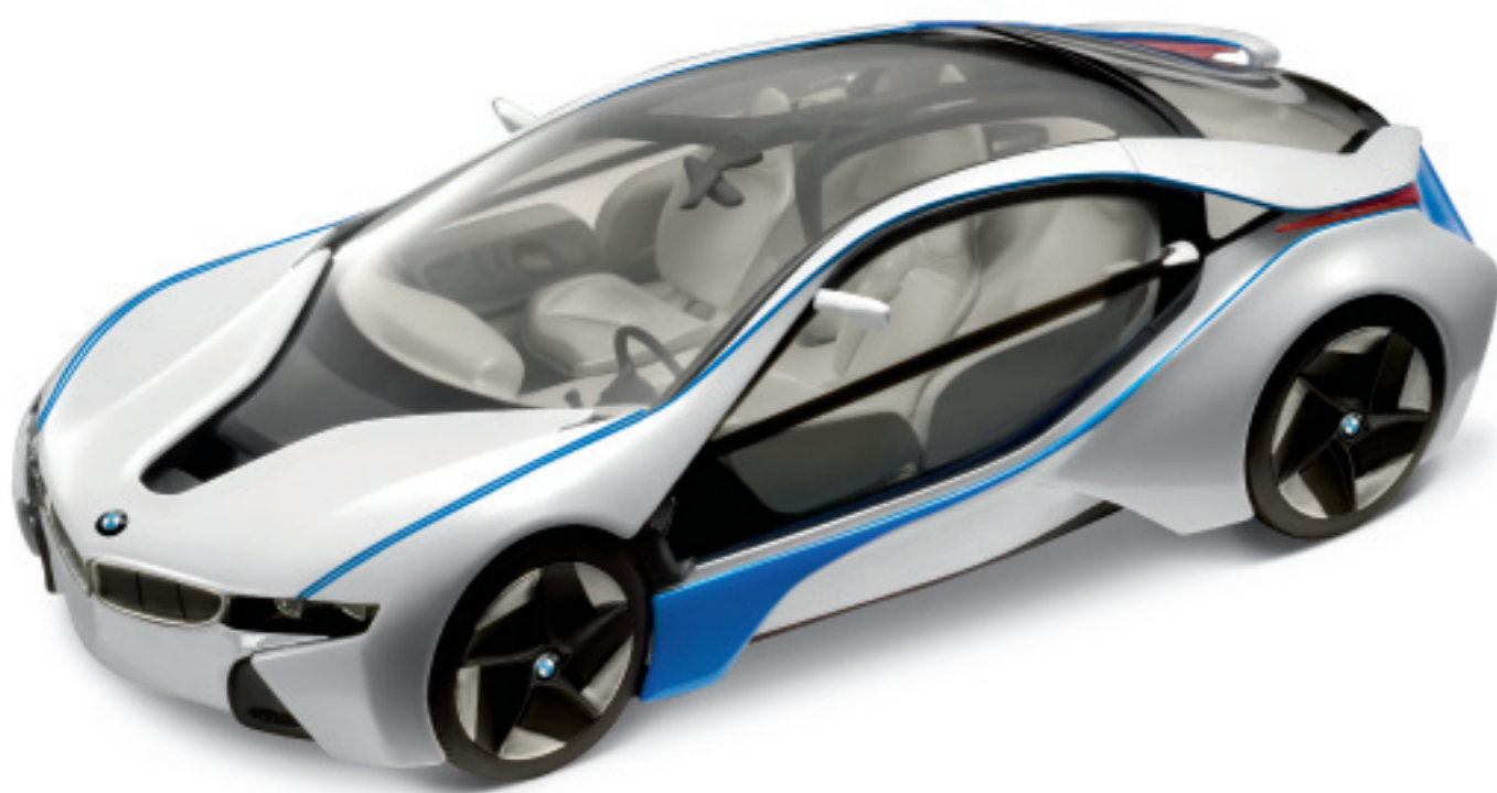
BMW Vision EfficientDynamics. The BMW Vision EfficientDynamics concept car will not just impress car experts. Even in its miniature form the concept for the forward-looking diesel-hybrid is sure to please. (Image may vary from the original)

Scale: 1:64 (Available from 04/2011) White/Blue 80 45 2 209 951