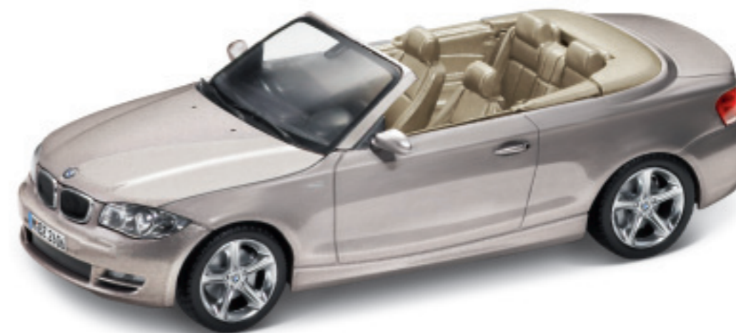
BMW 1 Series Convertible (E88). The level of detail of this 1:18 scale BMW 1 Series Convertible leaves nothing to be desired. The miniature features the elegant tailgate and elongated bonnet that people have come to know and love on the original vehicle. The brake system and engine compartment are faithfully modelled on the original. The doors, boot lid and bonnet can be opened, permitting an interior view that will warm the heart of any BMW enthusiast.

Scale: 1:64 (Available from 04/2011) White/Blue 80 45 2 209 951