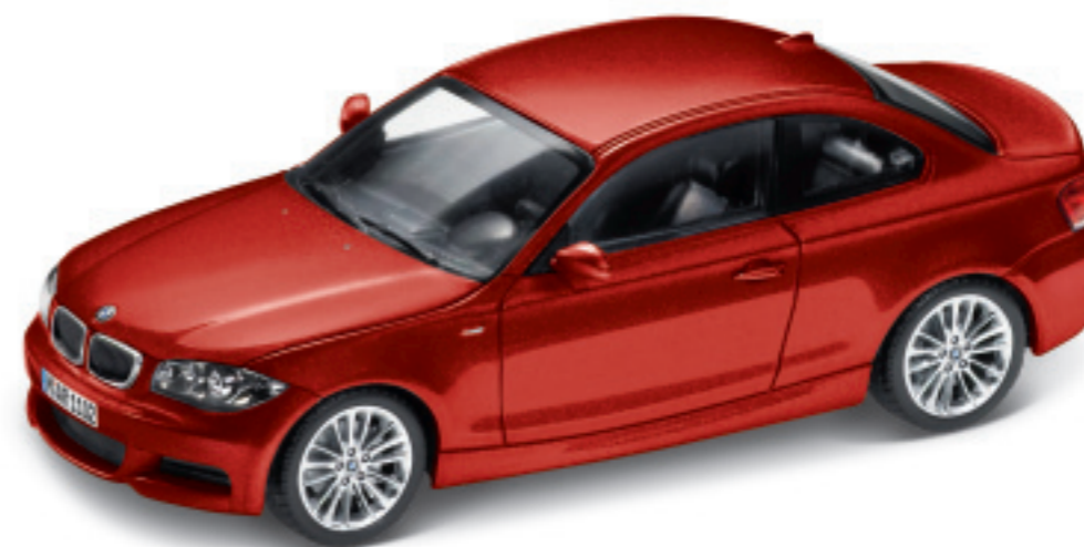
BMW 1 Series Coupé (E82). This miniature is a real eye-catcher - and not just because of its colour. The elongated bonnet, trapezoidal roof shape and crisply formed tailgate demonstrate just how perfect proportions can be. The original wheel rims with BMW logo are an inspired touch. The interior of the 1:18 scale model of the BMW 1 Series Coupé also promises plenty of enjoyment. Leather seats and genuine carpeting make it feel like you are looking at the original.

Scale: 1:18 Cashmere Silver 80 43 0 427 020 Sparkling Graphite 80 43 0 427 022 Titanium Silver 80 43 0 427 021